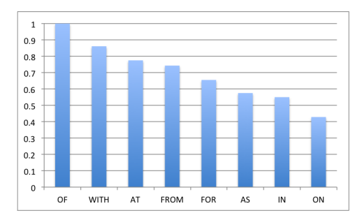
Figure 2: Accuracy of Stanford parser for the top eight most frequent preposition on PPAA instances from news data.

correct words. In all these works, no prior knowledge is taken into account, except for semantic type information [20].